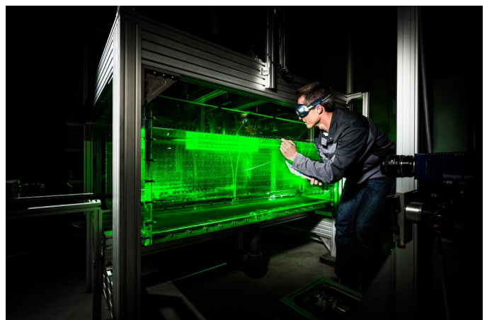
Figure 1: Water model of a thin strip caster

Since the kinematic viscosities of molten metals and water are quite similar, the flow characteristics of both fluids are almost equal. Therefore, a study of melts in water models is possible. At the IOB, there are several water models for experimental investigations, e.g. of converters, ladles, tundishes and casting moulds (see Fig. 1).